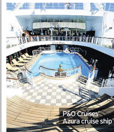
P&O Cruises' Azura cruise ship