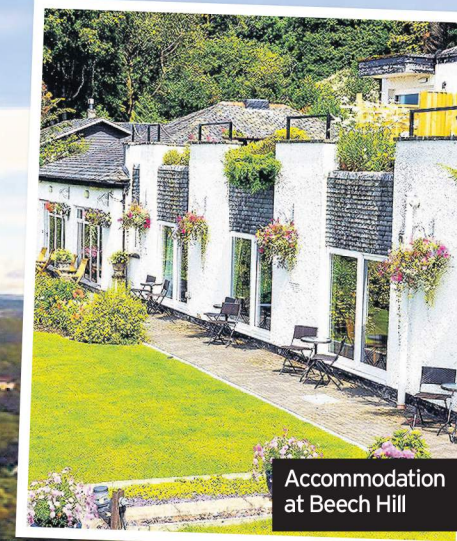
Accommodation at Beech Hill